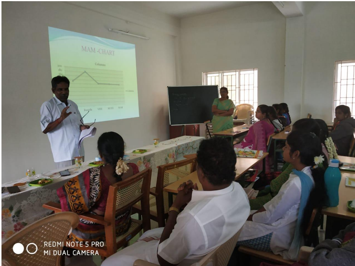
Motivational talk on Ida Sophia Scudder 25-09-2019